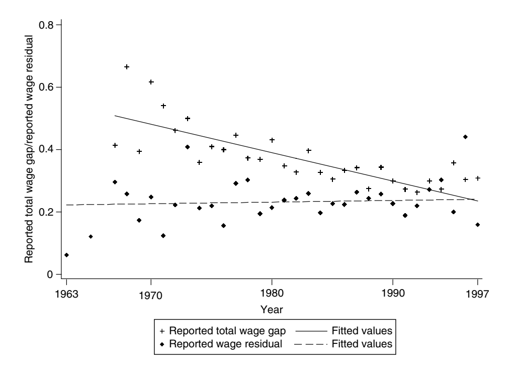
Figure 1. Reported log wage gaps over time.

time period 1963–1997, this decline is almost entirely due to an equalization of productive characteristics: females have become better educated and trained. The reported Blinder–Oaxaca wage residual is practically constant over time.